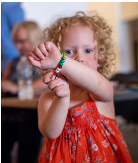
Youth program, Family Day participant.

The Museum hosted Grammy-winning musician Terri Lyne Carrington alongside visual artist Mickalene Thomas for an art/music showcase in partnership with the Carr Center. Together, Carrington and Thomas filled our cafe with dynamic visuals and a lush soundscape featuring local musicians.