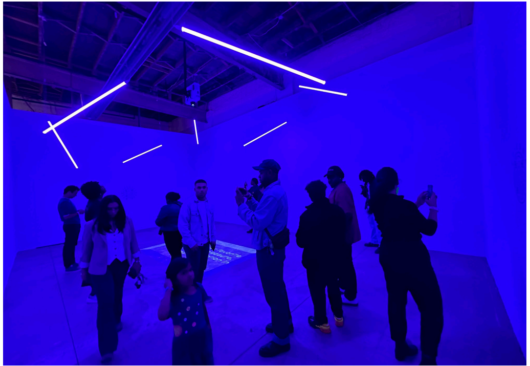
Museum visitors in KESSWA's TRANSCENDENCE .