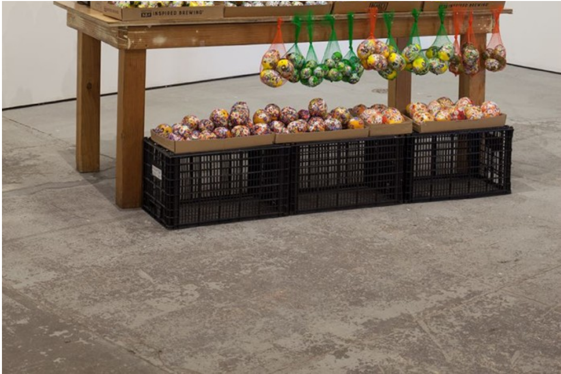
Tutti Frutti, 2017. Plastic fruits, stickers, crates, cardboard boxes.