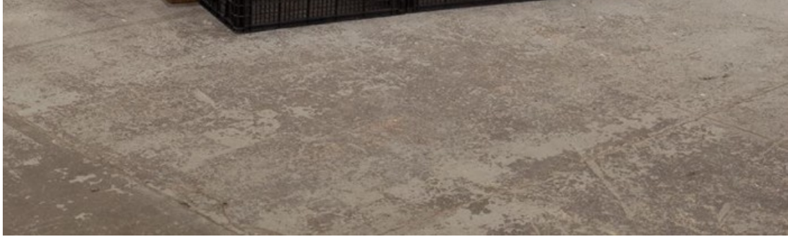
Tutti Frutti, 2017. Plastic fruits, stickers, crates, cardboard boxes.