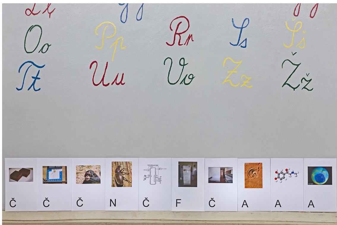
Adriana Ramić, Machine that the larvae of configuration , 2017