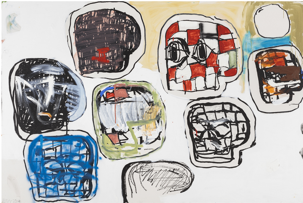
Image: KAWS, ALONE AGAIN (2016). Acrylic on canvas, 72 x 120 in.

Fast Eddie: New Paintings is a solo exhibition of the Brooklyn-based artist Eddie Martinez (American, born 1977). Featuring over 12 new paintings, this solo exhibition will occupy two gallery spaces showcasing never-before-seen paintings. Martinez's masterful abstract compositions include the artist's signature motif of floating heads and gestural sweeping paint strokes. Spanning from popular urban culture to Action Painting, Automatism, and Surrealism. Martinez's work joins together painting and drawing, abstraction and representation in non-traditional ways. Permeated with a sense of personal iconography, his practice often combines signature figurative elements, such as bug-eyed humans and eclectic headgear with gestural, abstract blocks of color. Energetic and raw, his paintings employ an aggressive use of color and texture with various combinations of oil, enamel, spray paint, and collage elements on canvas.